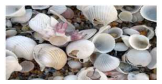
Figure 3 The 'kulibia' or cochlea

The analysis of Maluku local wisdom, specifically Southwest Maluku, is the diversity of marine life specifically 'kulibia'. Kulibia is often found on the coast during low tide. Students are familiar or well acquainted with the various types of crustaceans and it becomes interesting if they are used in learning integers.