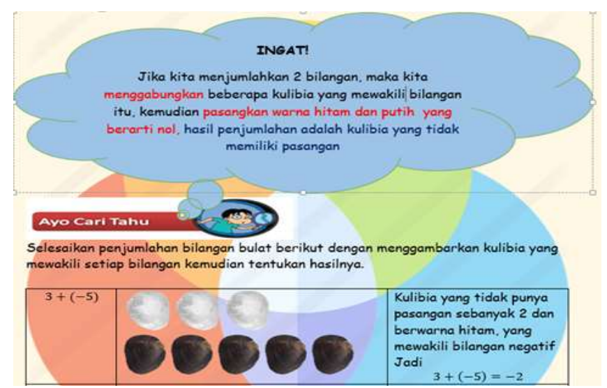
Figure 4 Examples of Teaching Materials