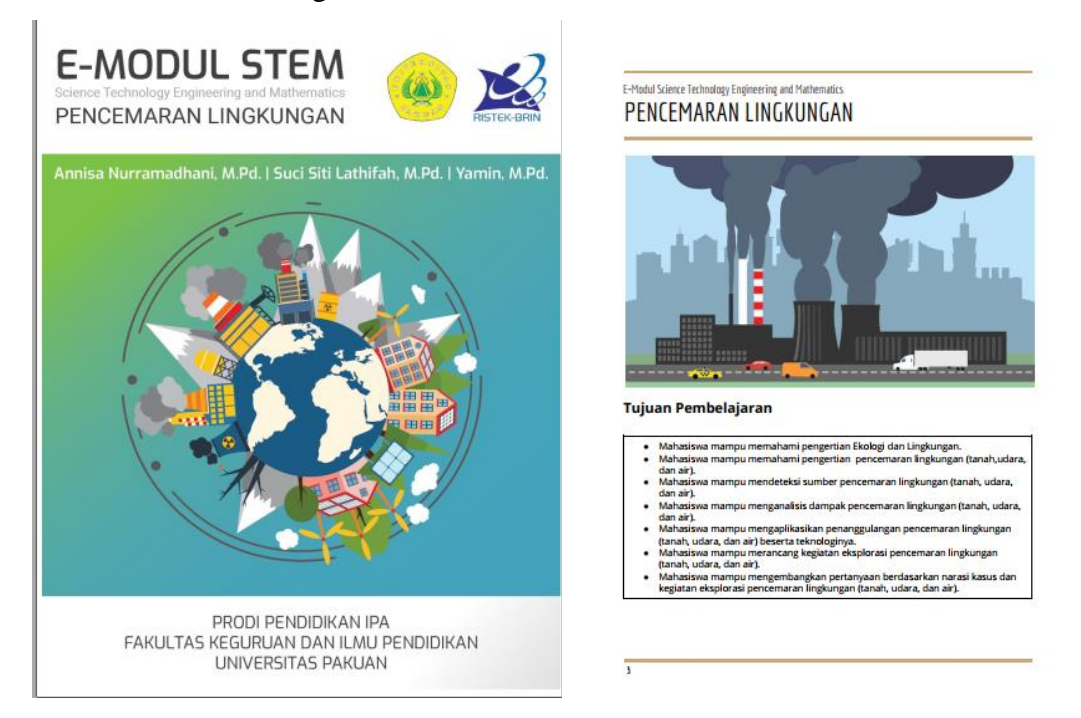
Figure 1. STEM based e-module cover and learning aims

Table 3 provides that information the STEM-based E-Module is feasible to implement in science learning because all the component that has been scored by expert judgment reaches the very valid category with revisions in little aspects such as typing error or some layout for picture and illustration that has already revised. The cover and content view of STEM-based E-Module are shown in Figure 1 below.