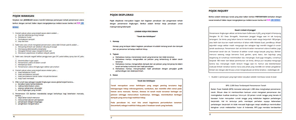
Figure 2. Sample of pojok wawasan, pojok eksplorasi, and pojok inquiry

STEM-based E-Module is an integrated teaching material that is constructed in electronic form. All the topics and content are containing the integration of science, technology, engineering, and mathematics. STEM-based E-Module also provides the way to get used to asking a question for students by placing all the sub-topics with interrogative sentences. Not only the content and interrogative sentences but also the activity that is included in E-Module. There are three acts in every chapter or topics, for instance, pojok eksplorasi (the activity that asks students to do the exploration with a worksheet as guidance), pojok wawasan (the activity that asks students to answer all the multiple choices questions related to material that is given in every chapter), and pojok inquiry (the activity that asks students to make their questions based on reading material that provided in every chapter) that has a link which students can fill their task, response, and answer to google form directly. There is an example of three activities in STEM-based E-Module, as shown in Figure 2.