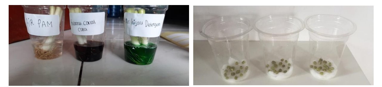
Figure 5. The students' experimental design from pojok eksplorasi

their condition. The example of students' experimental design based on STEM, which students have done briefly, is shown in Figure 5 below.